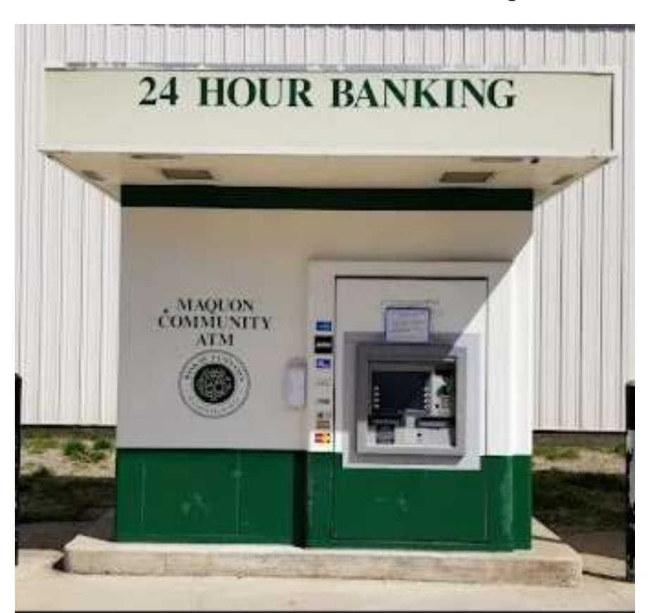
Stand-alone ATM located at 321 Main Street, Maquon, IL 61458